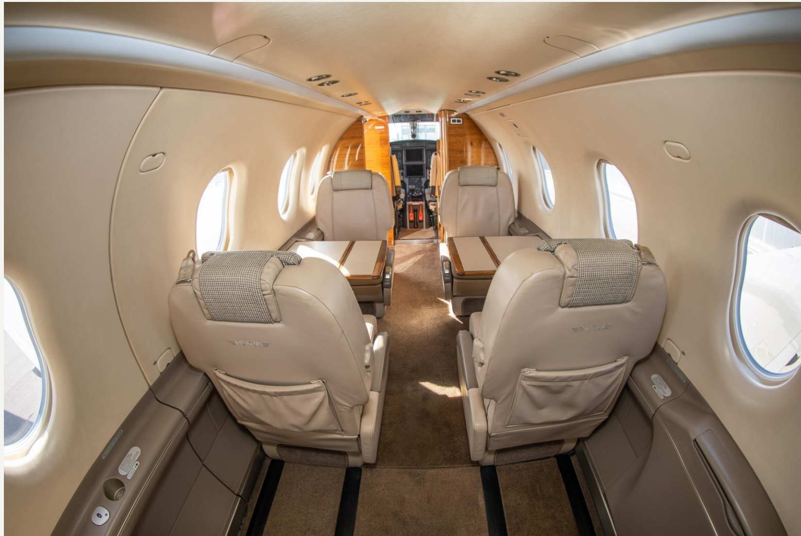
Mid Cabin looking Forward.