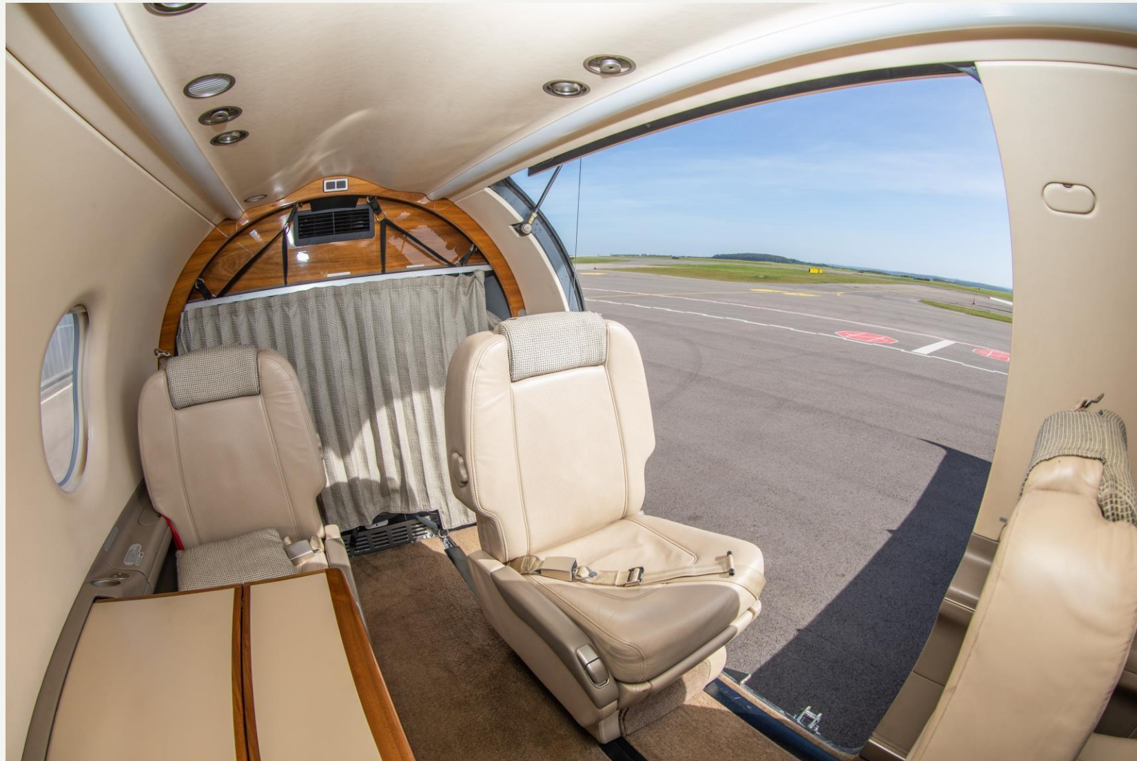
Aft Cabin with Cargo Door Open.