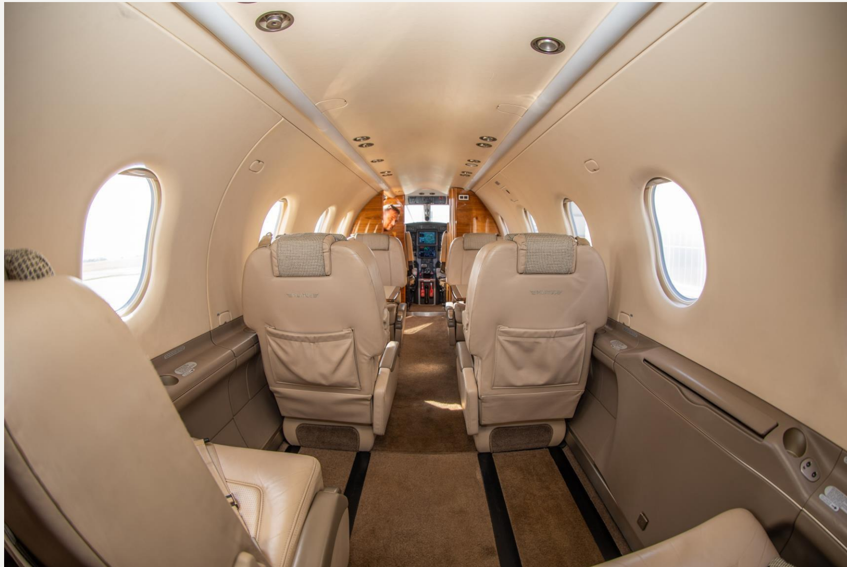
Aft Cabin looking Forward.