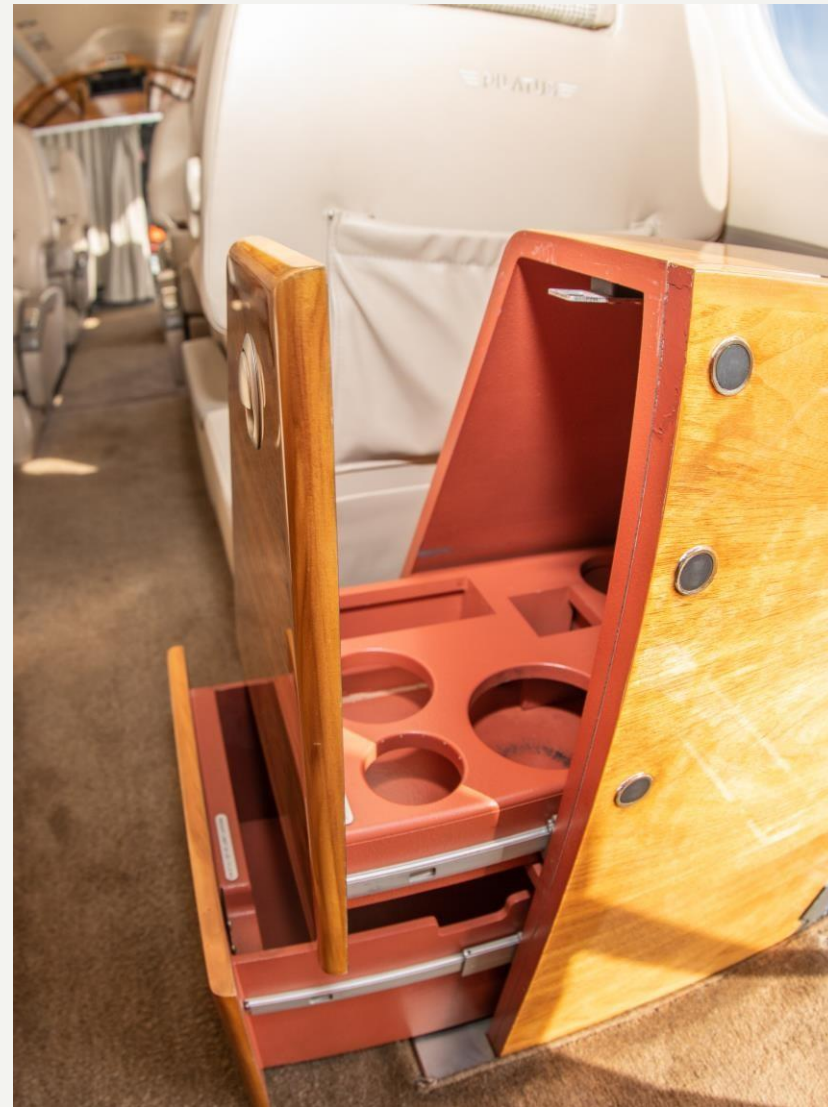
Left-Hand Forward Refreshment Center.