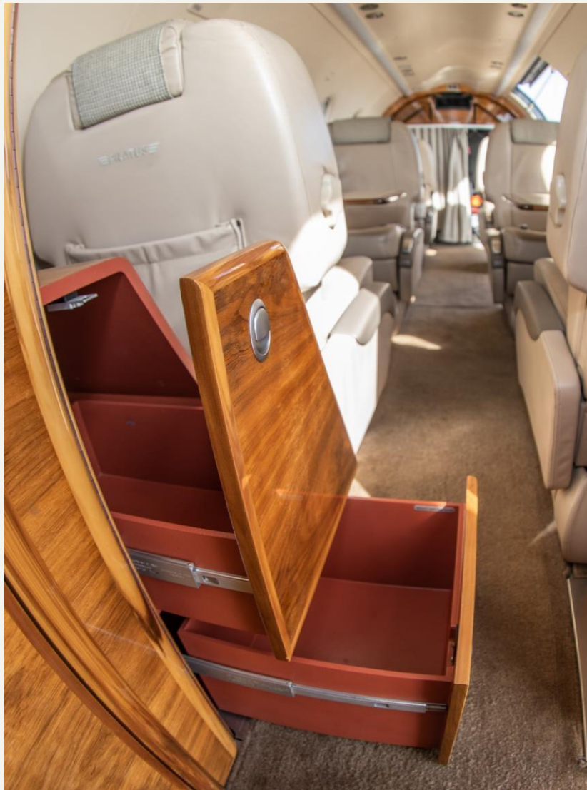
Right-Hand Forward Refreshment Center.