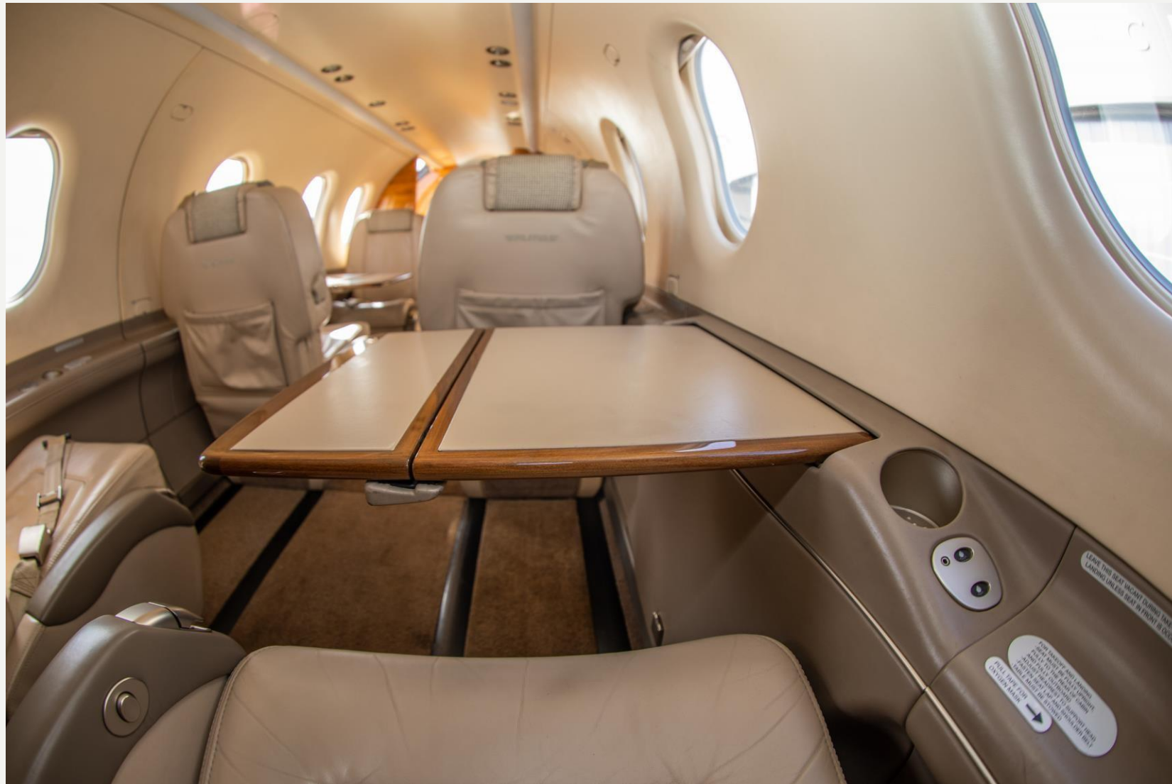
Aft Right-Hand Seat facing Forward with Folding Table Deployed.